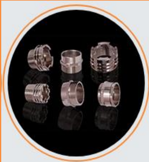
Brass Auto Parts