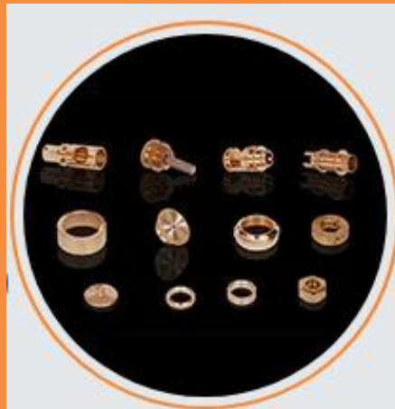
Brass Precision Parts