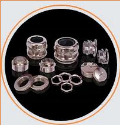
Brass Electrical Fittings