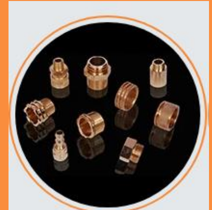
Brass Hydraulic Fittings