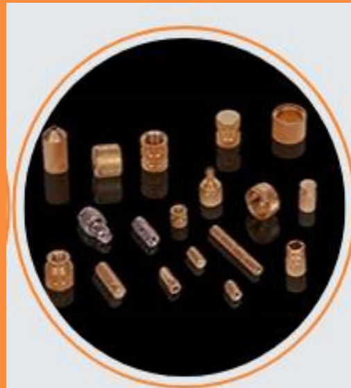
Brass Moulding Insert