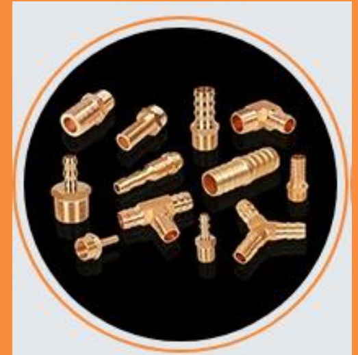
Brass Sanitary Fittings